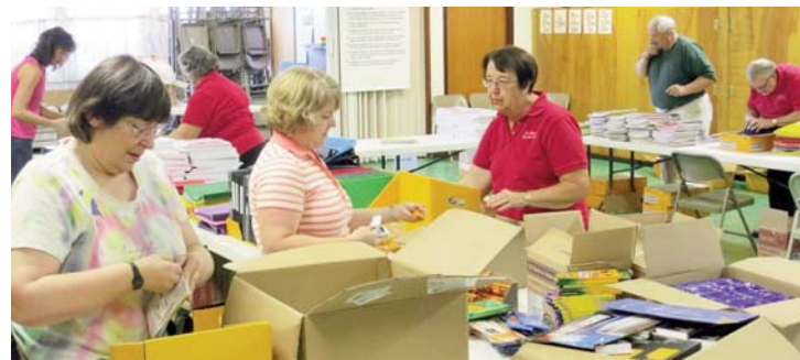
Workers at St. Matthew's, Ontario unpack, (top) and then distribute, (bottom) school supplies to low income area schoolchildren.