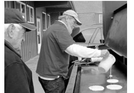
St. Matthew's, Ontario