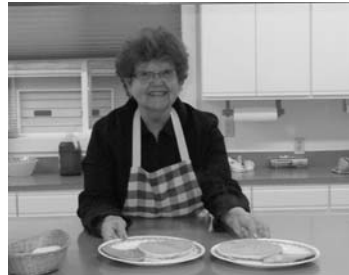
All Saints Episcopal/Hope Lutheran, Heppner