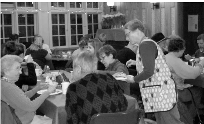
St. Peter's, La Grande