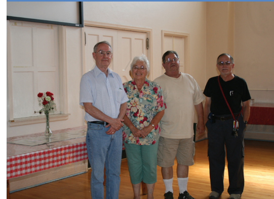
Members of The Church of the Redeemer’s Disaster Preparedness Team involved in responding to the fire.